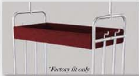
*Factory fit only