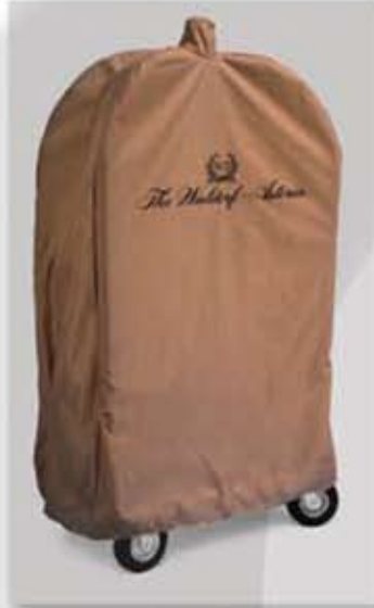
#243 or #248

#243 - Nylon Covers for the 43" long Birdcage® carts #248 - Nylon Covers for the 48" long Birdcage® carts Standard color is Taupe. Shown with optional custom logo, please call for information and pricing.