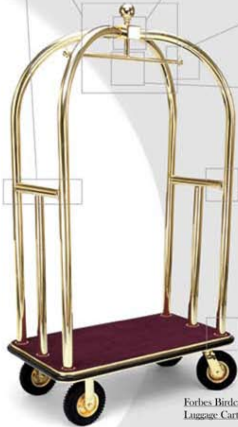
Forbes Birdcage® Luggage Cart Design